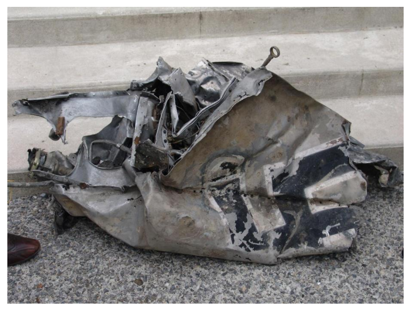
A part of the FW-190 found in 2011. It is thought to be the aircraft flown by Uff. Karl Achenbarch and shot down by Lt. Wilson Harrell, 394<sup>th</sup> FS (Philippe Lantiez)

It makes a total of 23 Focke-Wulf 190 destroyed, 4 probable and 6 damaged.