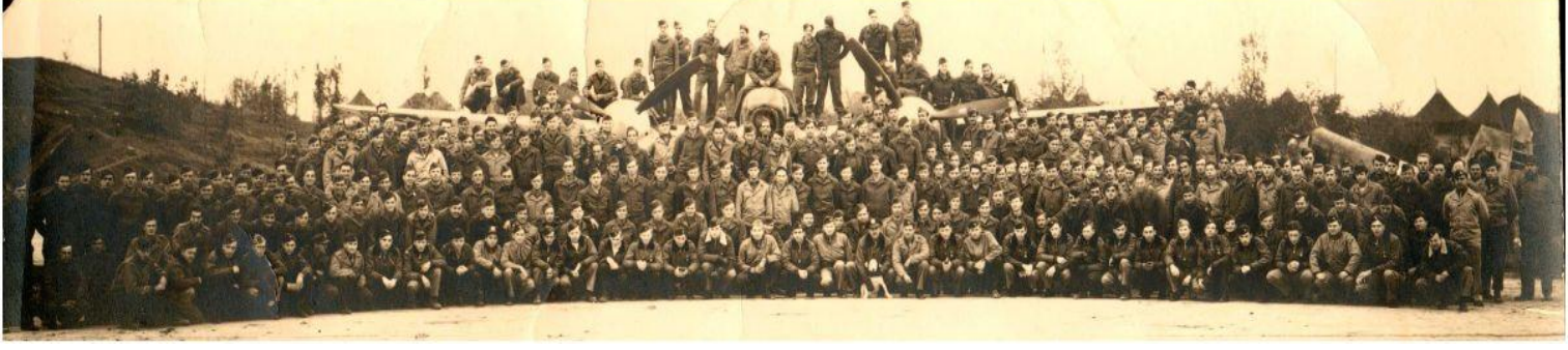
367<sup>th</sup> Fighter Group newsletter – Issue # 10 – September 2014

The losses of the II/JG6 were the highest ones ever seen for the Luftwaffe in one day during WWII. The Hauptmann Elstermann engaged the P-38's of the 394th FS without asking one or two "schwarms" (flights) to act as top cover. The losses of the four P-38's of the Red Flight can be explained by the fact that the German pilots concentrated their attack on them first before engaging the 2 others flights of the 394<sup>th</sup> FS. The claim of the Red Flight's pilots after they made it to the squadron later in September shows that although outnumbered they managed to face the enemy with brilliant skills. As the BOTNAFs (Buddies Of The Ninth Air Force) flew many more dive bombing and strafing missions than bomber escort missions flown by the 8<sup>th</sup> Air Force jockeys they had less chance to encounter the German fighters. The total claim for the 22 and 25 August 44 for the 367th FG is 43 (20+23) enemy aircrafts. It shows that the pilots of the Dynamite Gang could do as well as their friends of the 8th Air Force.