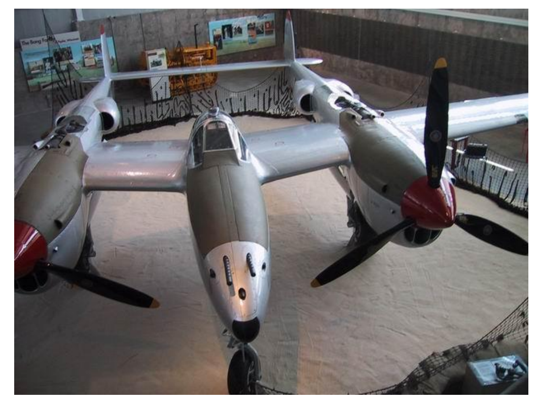
The P-38 Lightning of the Bong heritage Center