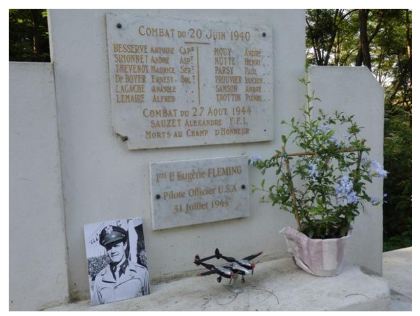
A bouquet was placed before the plaque on July, 31, 2014, for the 70<sup>th</sup> anniversary of Gene's death