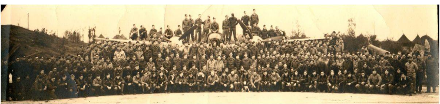
367th Fighter Group newsletter – Issue # 10 – September 2014