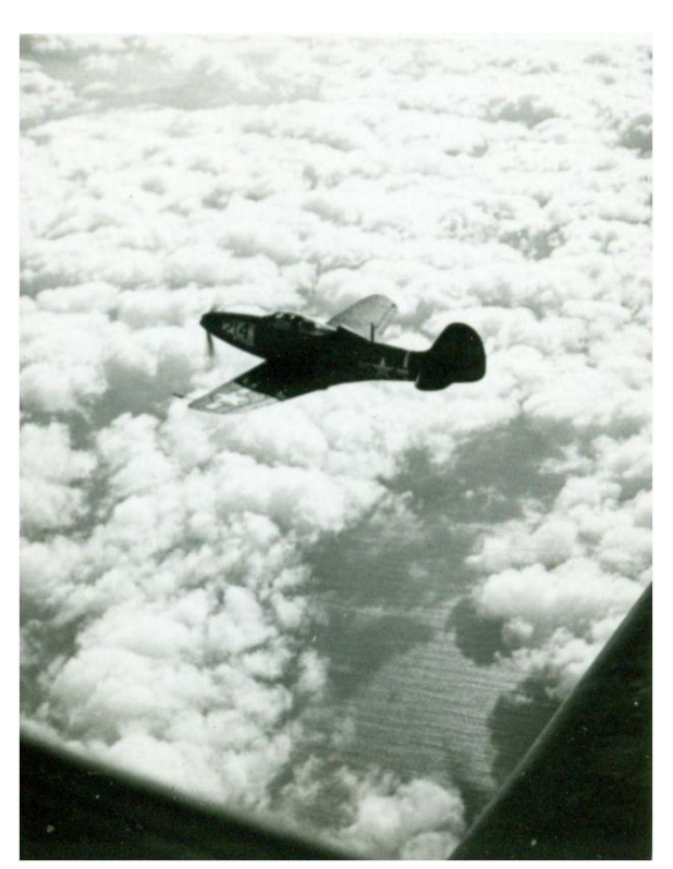
P-39 of the 367th FG over the Pacific Ocean in February 1944