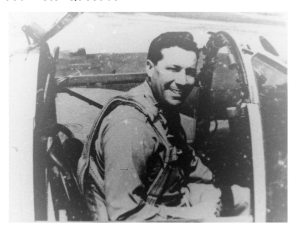
Major General 'Pete' Quesada while on visit to 367th FG in Stoney Cross