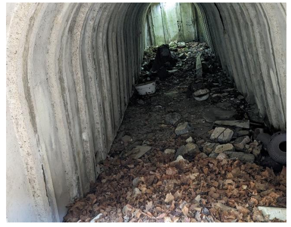
One of the remaining bomb shelters