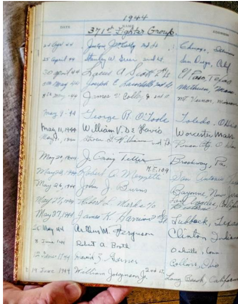
A page from the Bisterne Manor Guest Book from 1944